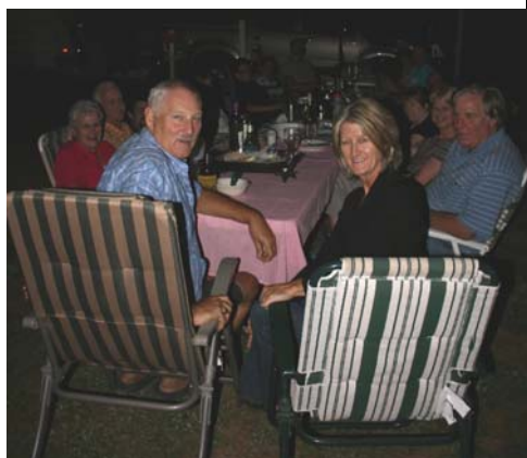
Smile for the birdie everyone...

exquisite and a credit to those who provided. The evening continued with many laughs and stories concerning flames and camping equipment. Not to mention a couple of glasses of wine, after all it was a wine trip.